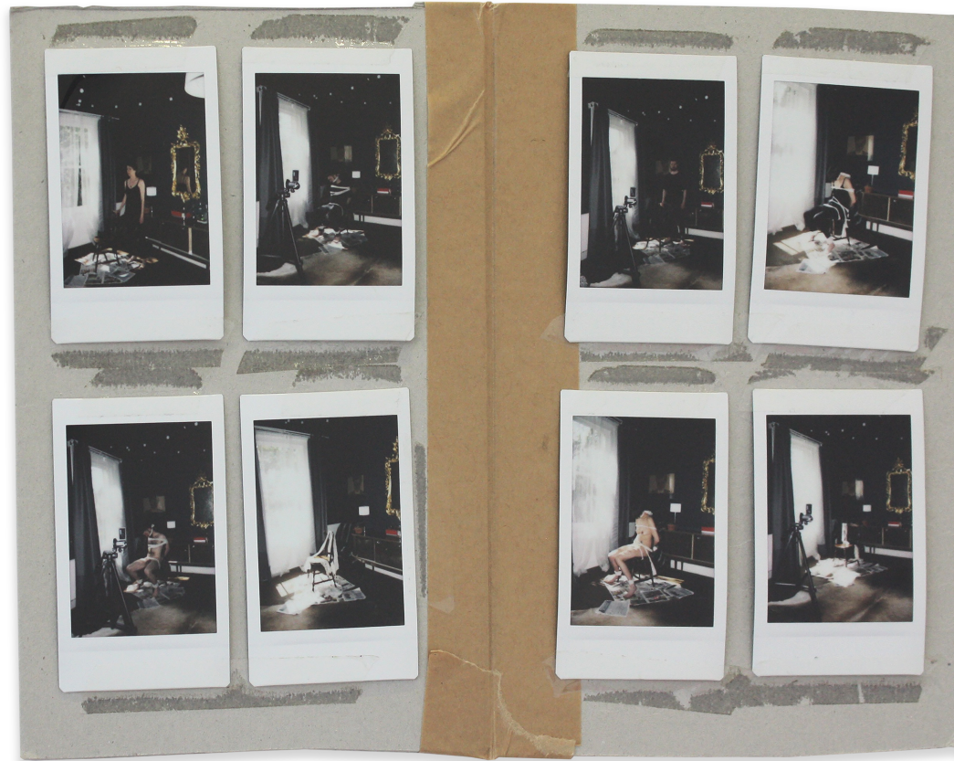
To Have and to Hold 2016 Polaroid Collage 22 x 30cm