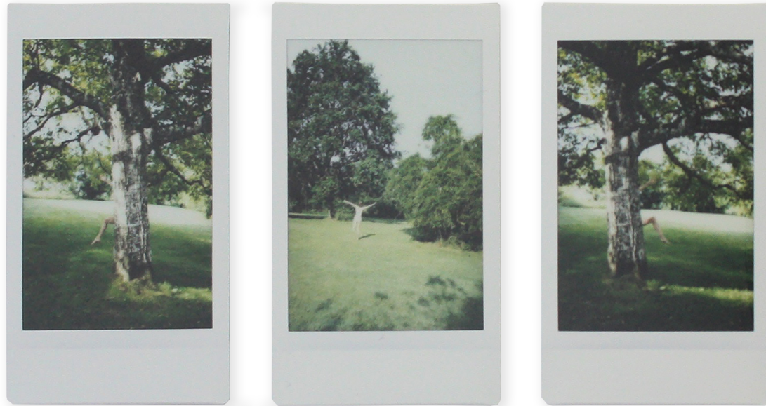
Joy 2016 Polaroid Triptych Each Print 8.6 x 5.4cm