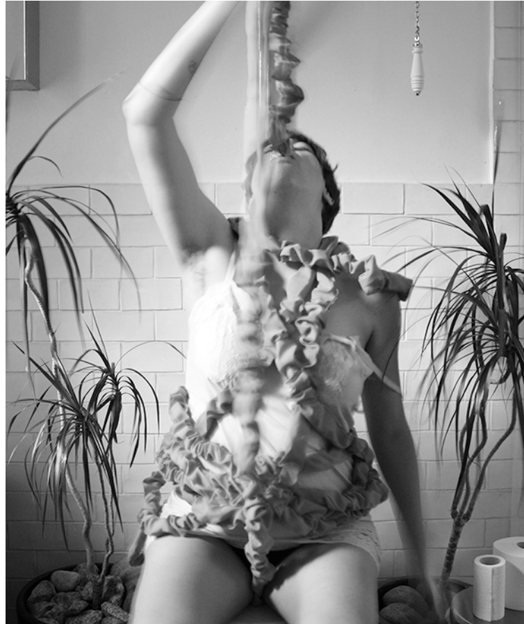
Slave to the Rhythm 2018 Inkjet – Edition of 3 14 x 16.6cm