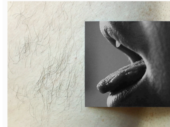
'Exploration VI' 2018 Inkjet – Edition of 5 11 x 8.8cm