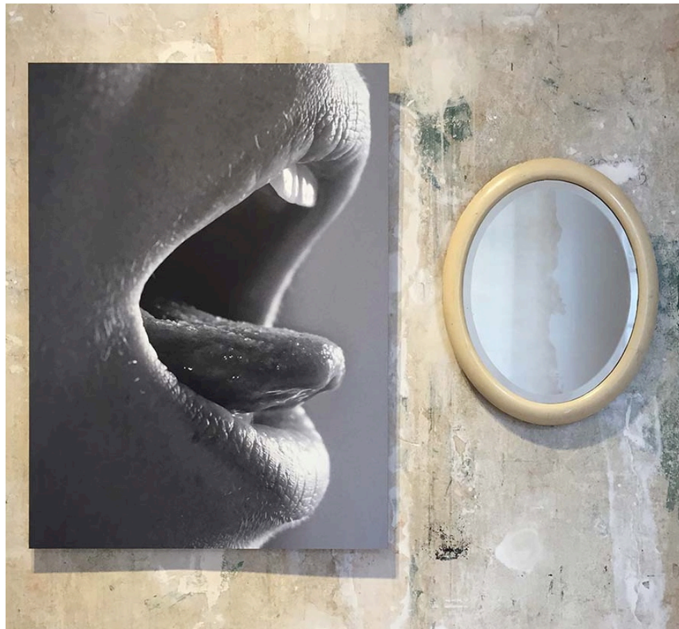
'Would You Like To Be Explored?' 2018 Aluminium Dibond print & mirror 80 x 100cm approx.