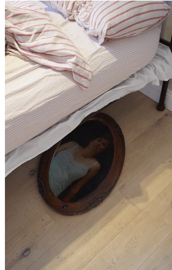
'Only After Dark' 2018 Bed, inkjet print & mirror Variable dimensions