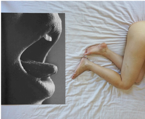
'Exploration III' 2018 Inkjet – Edition of 5 11 x 9cm