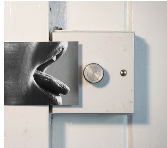
'Exploration II' 2018 Inkjet – Edition of 5 11 x 10cm