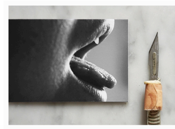
'Exploration IV' 2018 Inkjet – Edition of 5 11 x 8cm